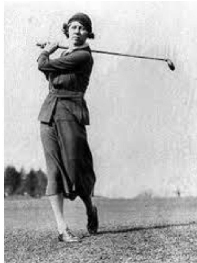
Joyce Wethered – UK on cigarette cards in the UK