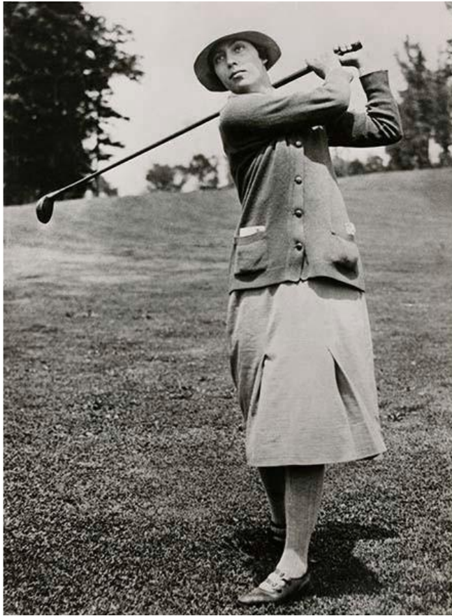
Glenna Collette Vare – USA Vare Trophy named after her