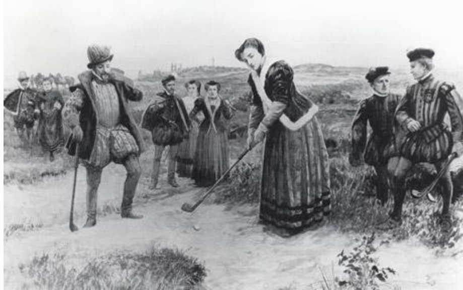
Mary Queen of Scots at Royal and Ancient- St. Andrews 1567